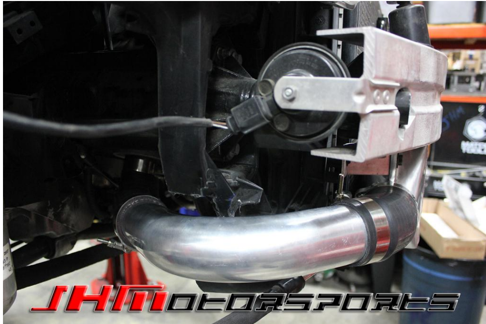
Driver Side Intercooler Pipe Fitment: