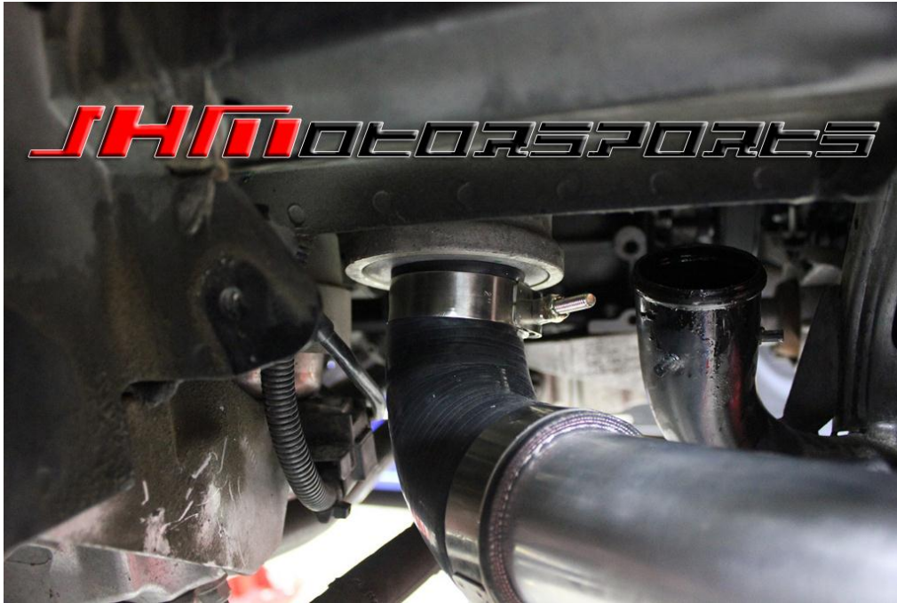
Core Support Trimming for passenger Side Intercooler Pipe: