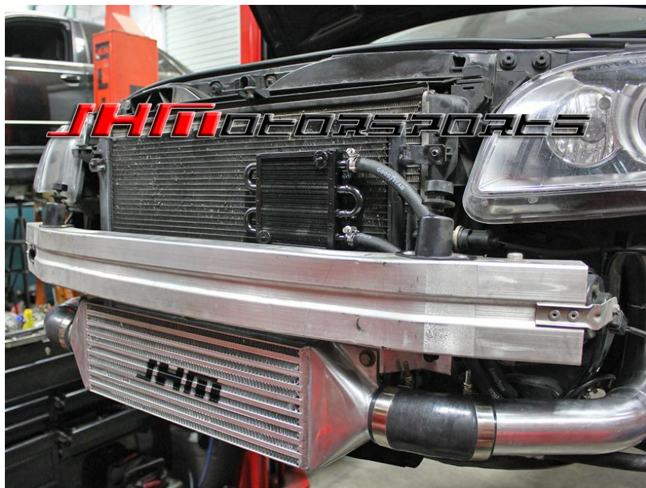
Intercooler Fitment Bottom View:

Small Core Fitment Front View/Power Steering Cooler Location (scroll down to see large core fitment and installation: